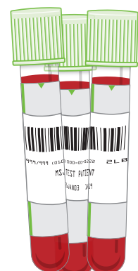
The Group Shot